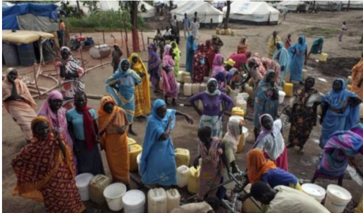
Sudanese refugees in a refugees camp in Maban, South Sudan

December 23, 2019 (JUBA) - The United Nations World Food Programme (WFP) in South Sudan has welcomed a contribution of $500,000 from Korea as overall humanitarian needs are deepening in the young nation with 7.5 million people requiring support in 2020.